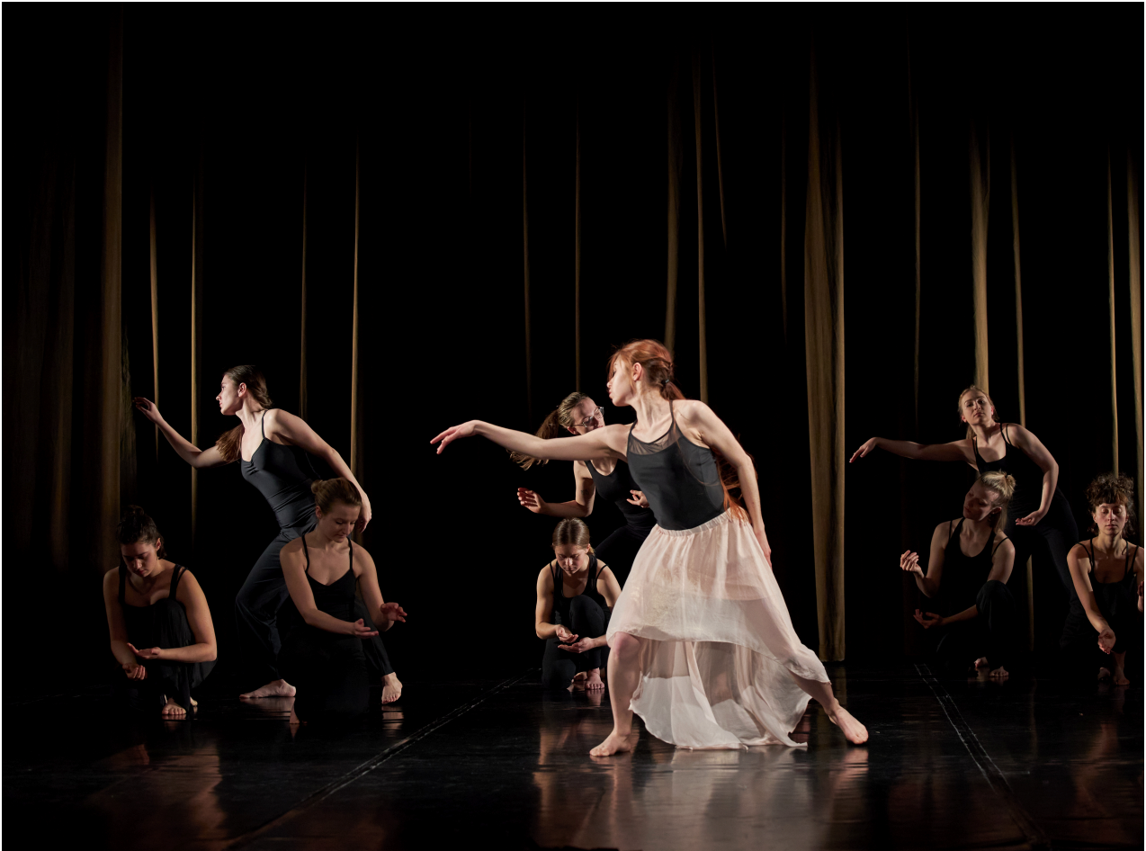
Photo no 2. Correspondence between foreground and background versus contrast with the middle group.

In this Part One worked in the way I use the most often - combining my experience in the eurhythmics with dance and theater. In the warm-up I introduce some elements, later crucial for the motoric coordination in the improvisation phase aimed to generate adequate movement material expected to be achieve.