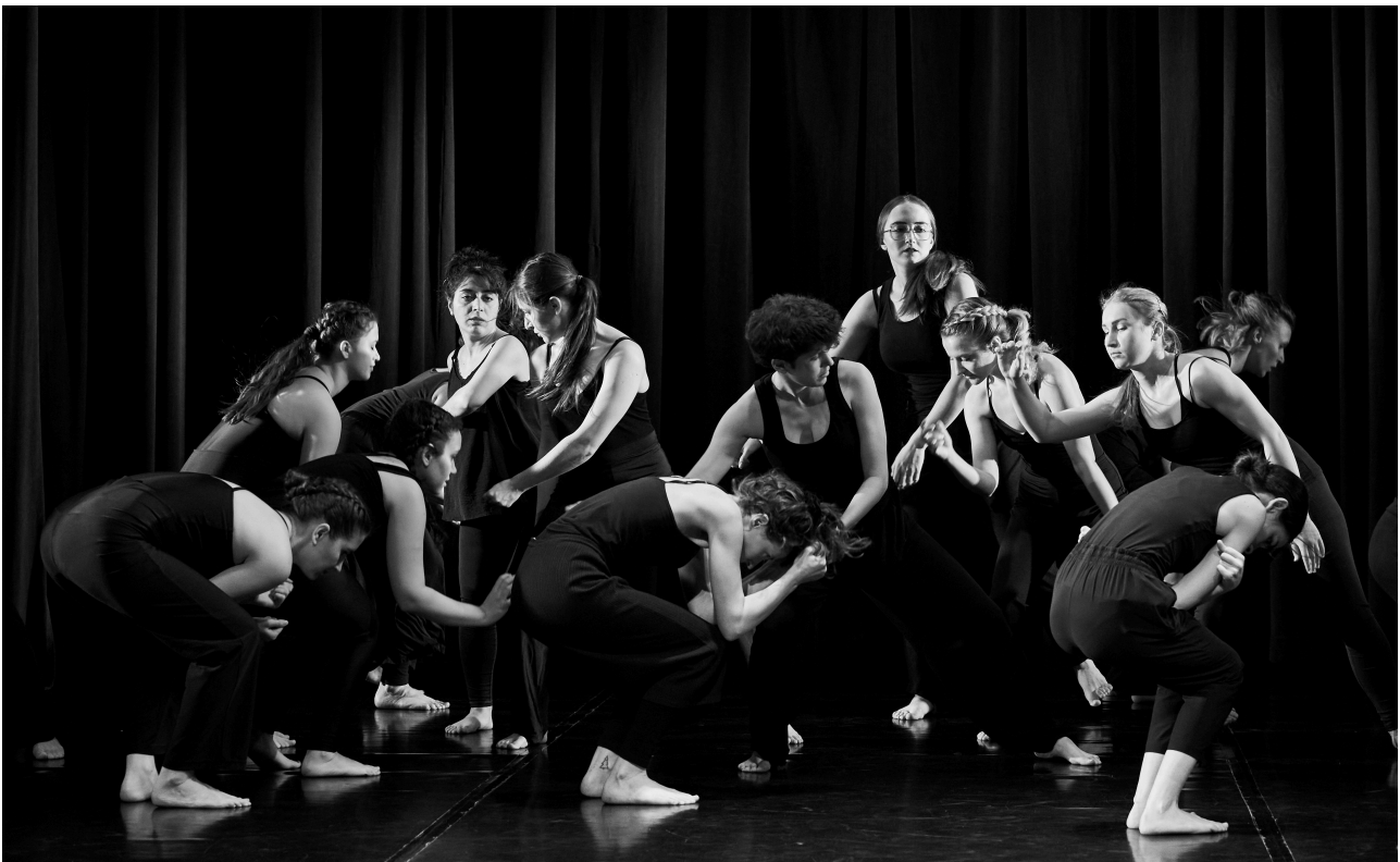
Photo no 3. Multi planarity - polimetric structure